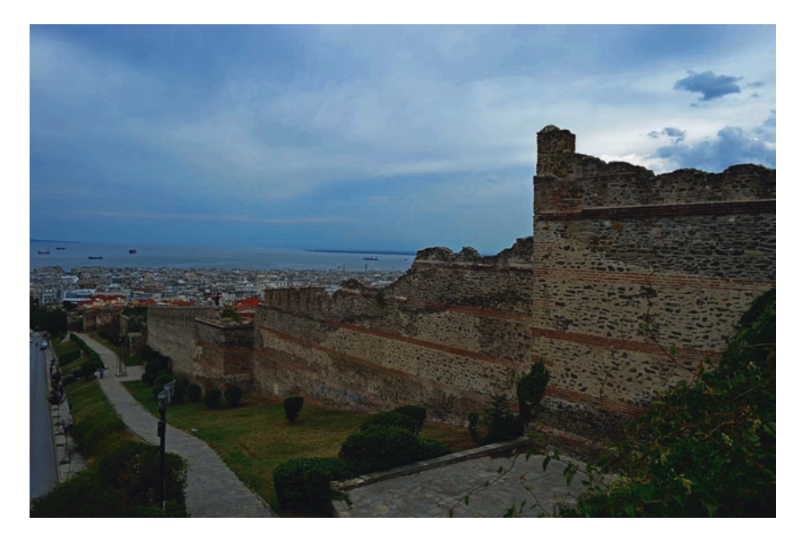
Fig. 3.5 Thessalonike (the walls)

The massive enceinte should be regarded as a sort of "ontological" characterization of the city both architecturally and archaeologically. In other words, and like in Nicaea, Attaleia, and, of course, Constantinople, they define and conclude the city both in terms of the urban fabric and imaginary (Bakirtzis 2010). Kaminiates and Eusthatios' descriptions allow us to assert that the city had an upper city-wall (so-called acropolis) whose ramparts betrayed two phases of construction: the first (endowed with triangular towers) harking back to a period prior to the reign of Justinian when also a large cistern was built; in the second stage, dated to the first